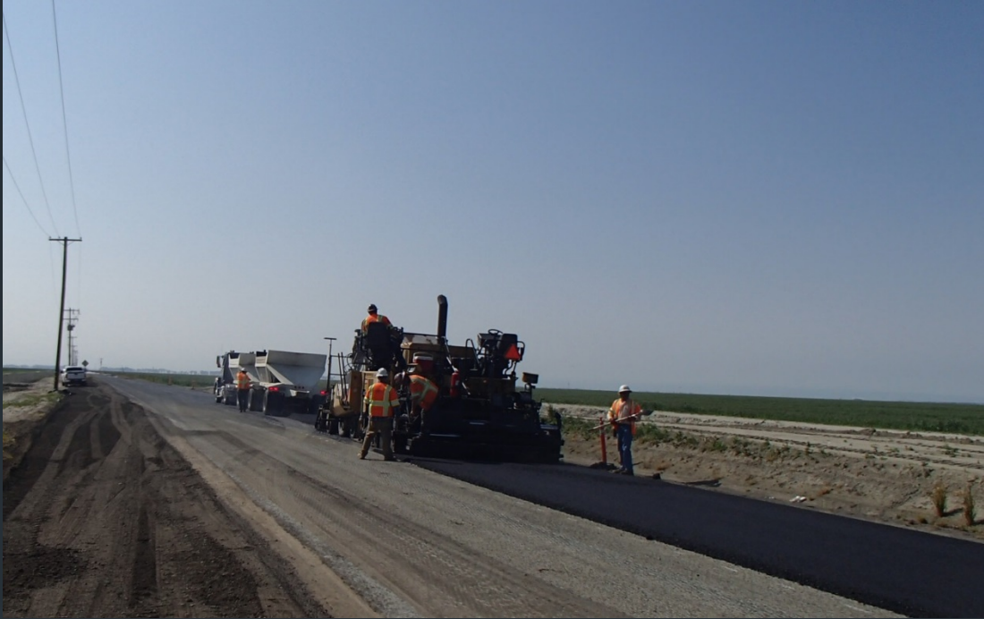
Construction of Road 40