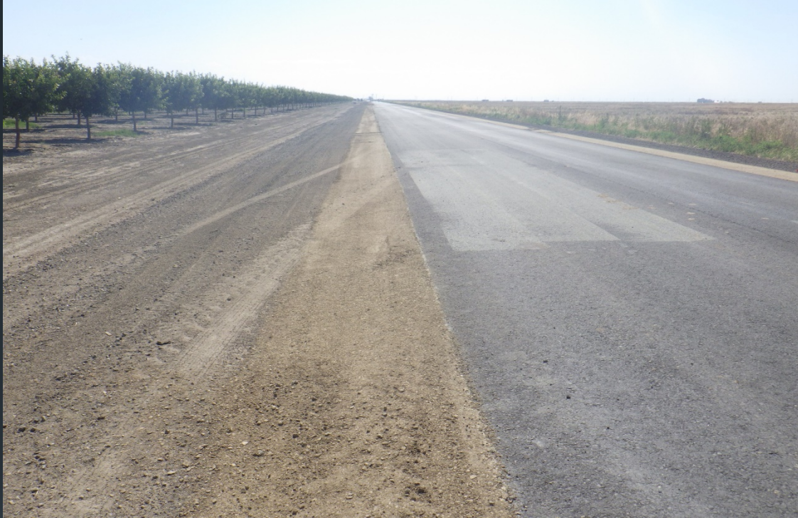
Construction of Avenue 120