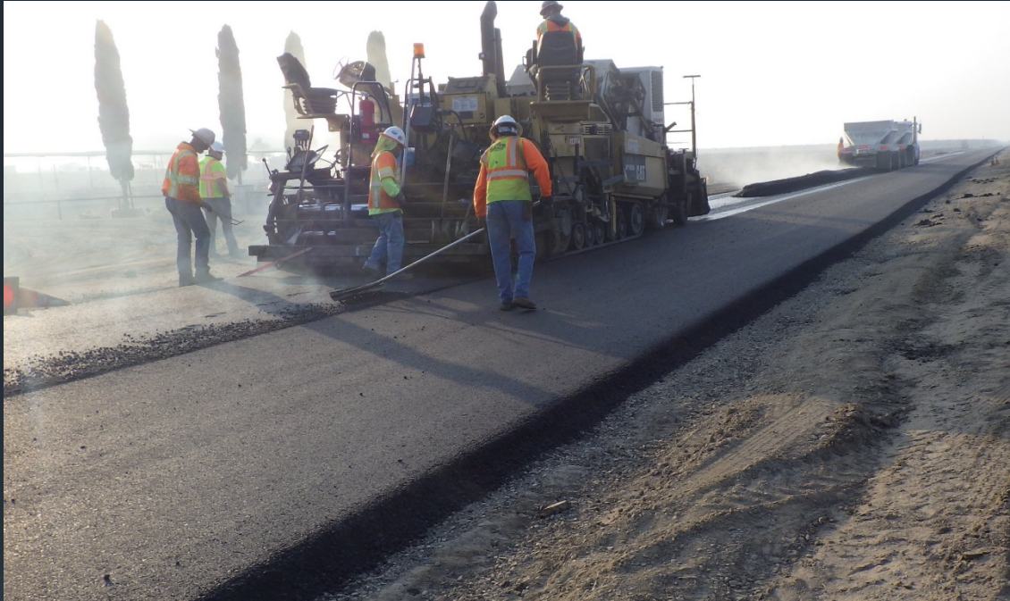
Construction of Road 24